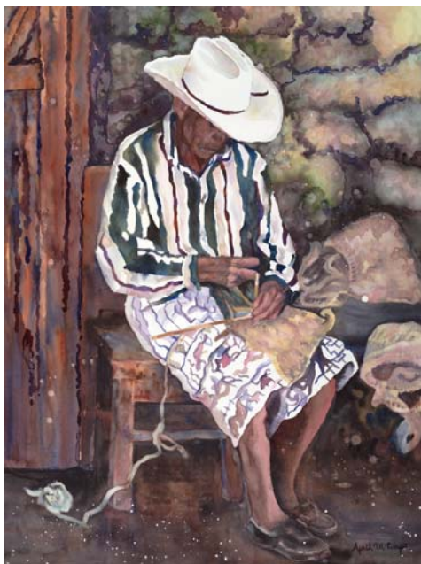
"Basket Maker" Fluid Acrylic and Watercolor

If a technique won't improve the painting or if it conflicts with the overall mood she is trying to achieve, then she doesn't use the technique. For example, in her city-scapes the repetition of patterns in the city is often the focus. Hard edged shapes are important, so Rimpo uses more controlled techniques to keep the edges crisp, but still uses wet-into-wet blending within shapes to achieve color variety.