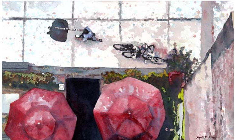
"Aerial Bikes II" Fluid Acrylic & Watercolor

The instructor's primary focus with every new student was to make sure they understood the importance of darks and lights in their paintings. He started everyone with graphite pencil drawing and wouldn't let them move onto other media until he felt they had captured the values (i.e., darks and lights) properly. Rimpo chose to move from graphite to colored pencil and then to oils during the 2 years she studied with this artist.