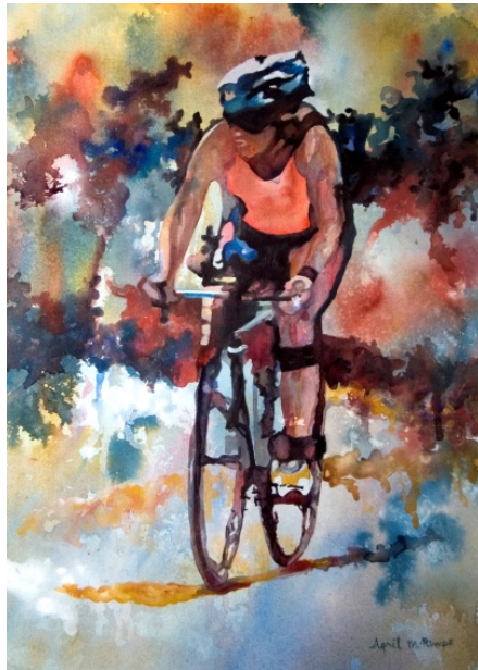
"Movement II" Fluid Acrylic