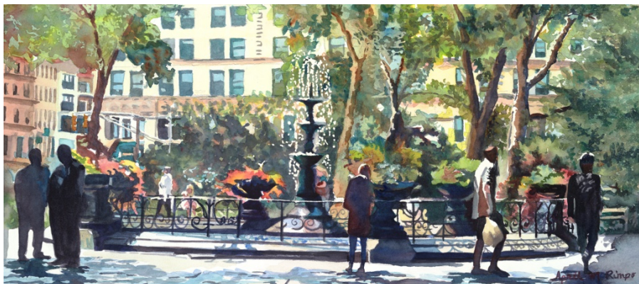
"Madison Square Fountain" watercolor

"My background in engineering taught me to see the world in a broad, expansive way, through the eyes of others."