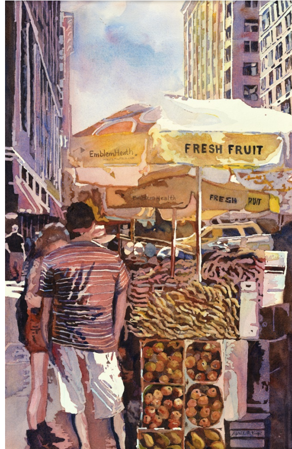
"Fresh Fruit to Go" Watercolor