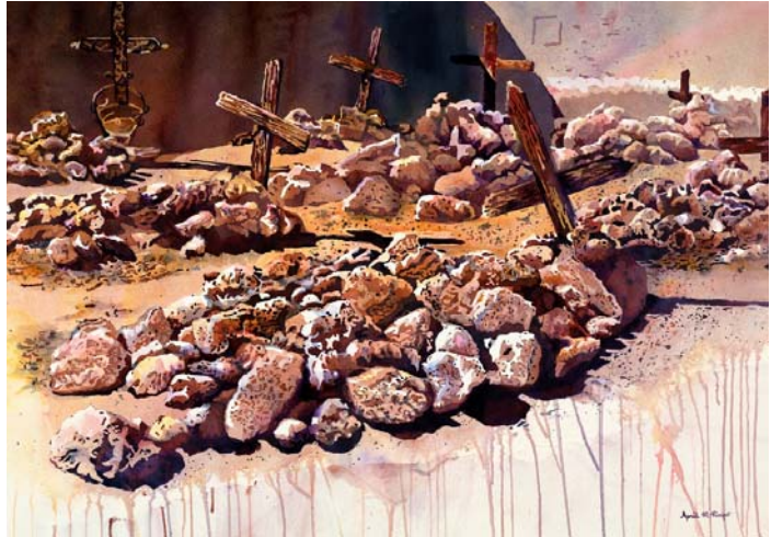
"Struggles in the Southwest" Fluid Acrylic