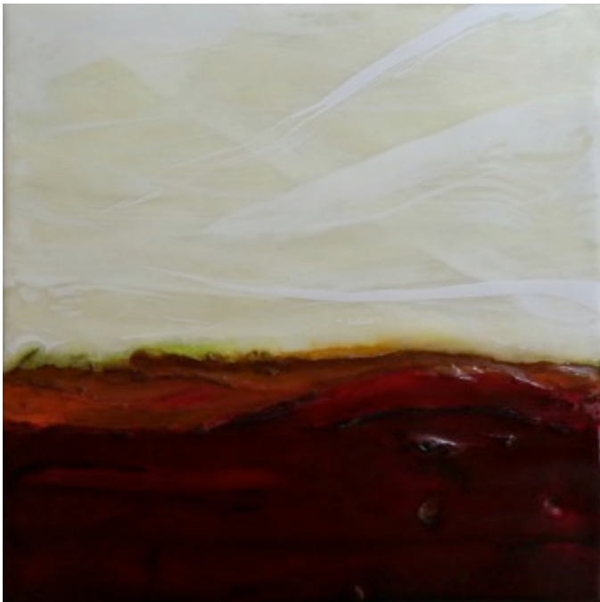
Vermilion Homage | 12 x 12 | Encaustic with Mixed Media including Rust