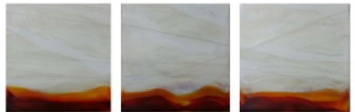
Zesty Morning, Noon, Night | Triptych 15 x 5 Encaustic with Mixed Media