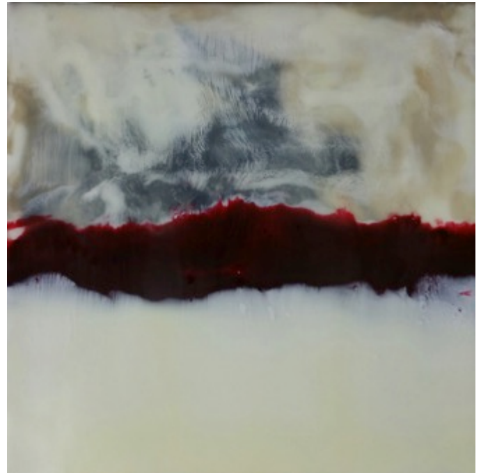
Emergence | 8 x 8 | Encaustic

and can relate to the significance in our lives.... The artwork still captures the same impact on us as when we first saw them and acquired them."