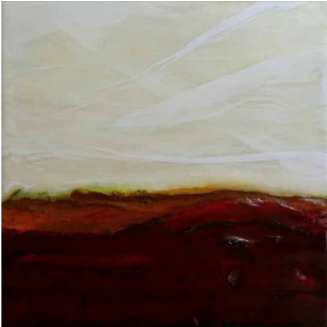
Vermilion Homage | 12 x 12 | Encaustic with Mixed Media including Rust