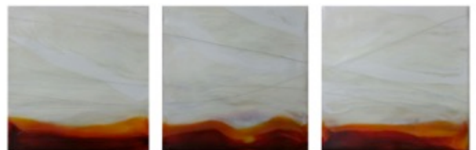
Zesty Morning, Noon, Night | Triptych 15 x 5 Encaustic with Mixed Media