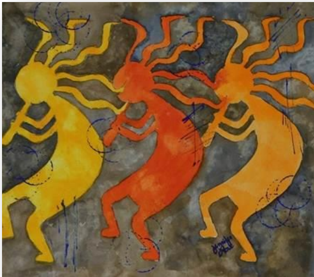
Kokopelli Three | 9.5" x 10.5" | Watercolor