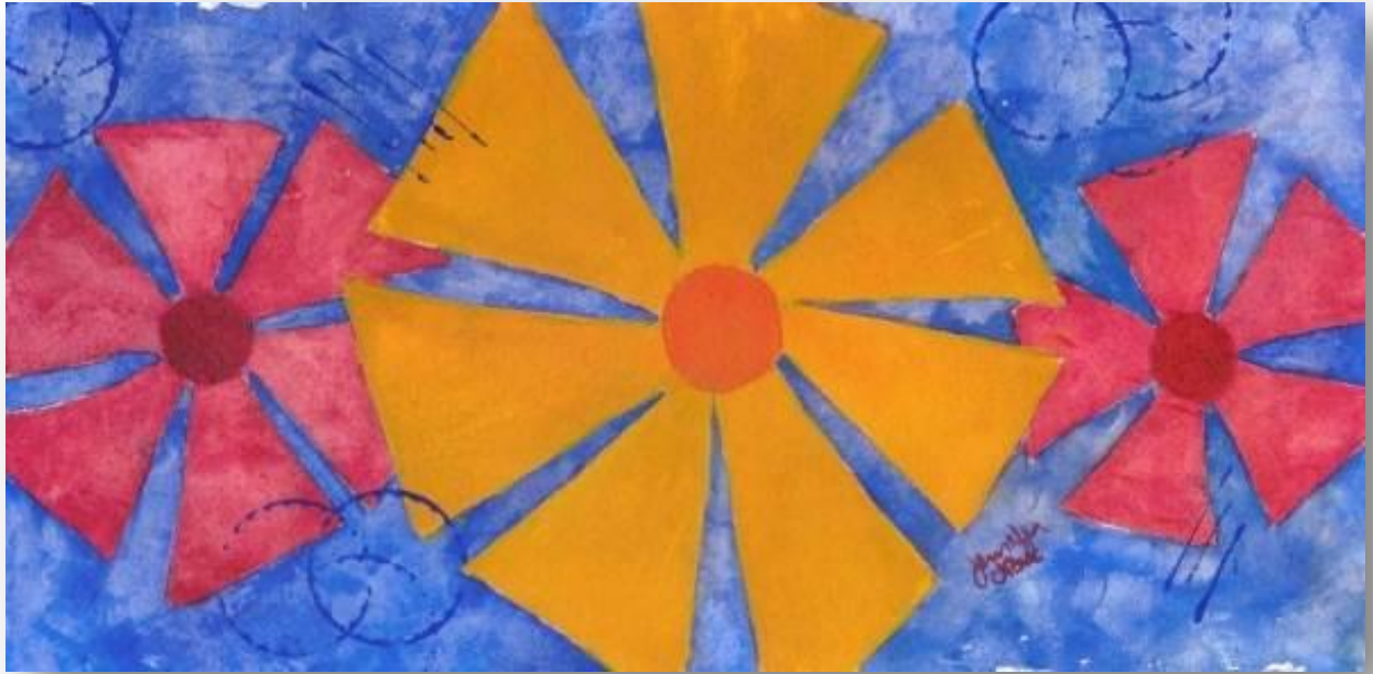
Peaceful Daisies | 5" x 10" | Watercolor