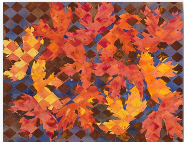
A Patchwork Fall | 20" x 25" | Watercolor