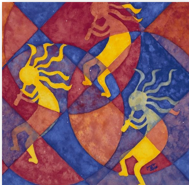
Threes | 13" x 13" | Watercolor

of the summer sun or the fresh, salty breeze on my skin. I feel the exhilaration of completing the hike to Delicate Arch.”