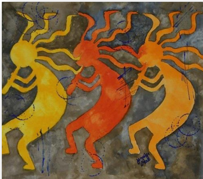
Kokopelli Three | 9.5" x 10.5" | Watercolor

“Every place I have traveled and culture I have experienced informs my art and my life. My love for Moab, UT emerges in the bright yellows, oranges, earth tones and Kokopelli images in my paintings. Crisp Cerulean and deep Ultramarine blues remind me of clear Scandinavian skies and beautiful waters. Cadmium Orange is the color of a summer sunset in Assisi. When I put paintbrush to paper, I feel the warmth