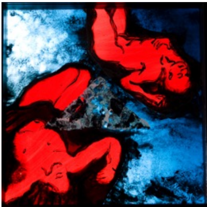
Tenth Plague- DEATH OF THE FIRSTBORN - MAKAT B'CHOROT