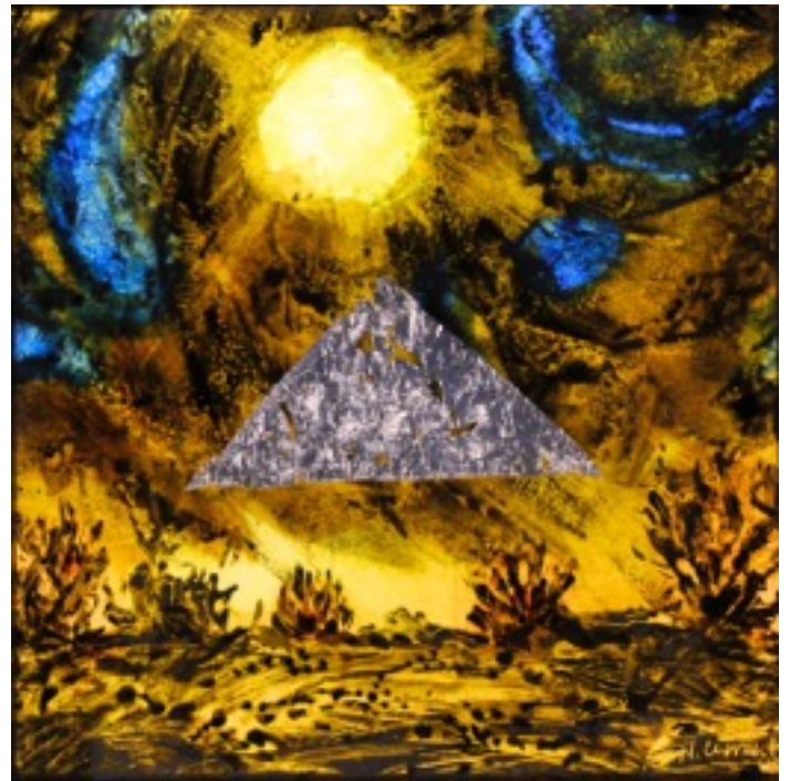
Fourth Plague- SWARMING THINGS - AROV