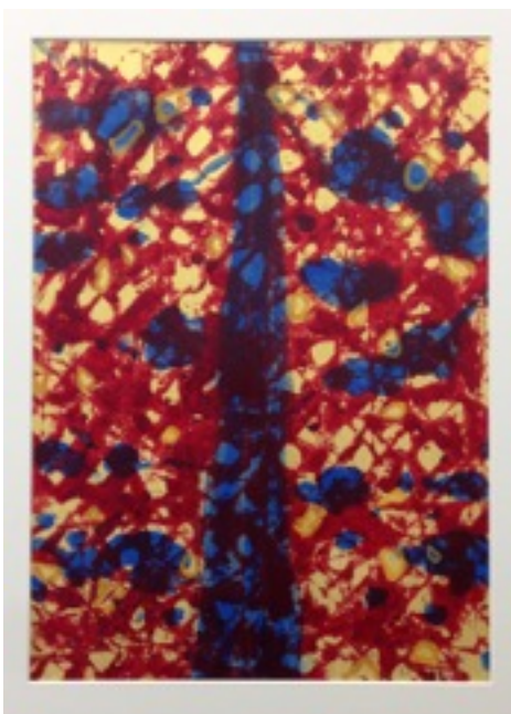
First Plague- BLOOD - DAM

The plagues of Blood, Frogs and Gnats arise from the dust of the earth or its waters. The background color, gold, represents both earth and Pharaoh's pride. The Israelites have not yet been separated from the people of Egypt, so they also suffer the effects of the first three plagues. The destruction wrought by the plagues appears over the earth and its waters as a net-like entrapment invading everything living there.