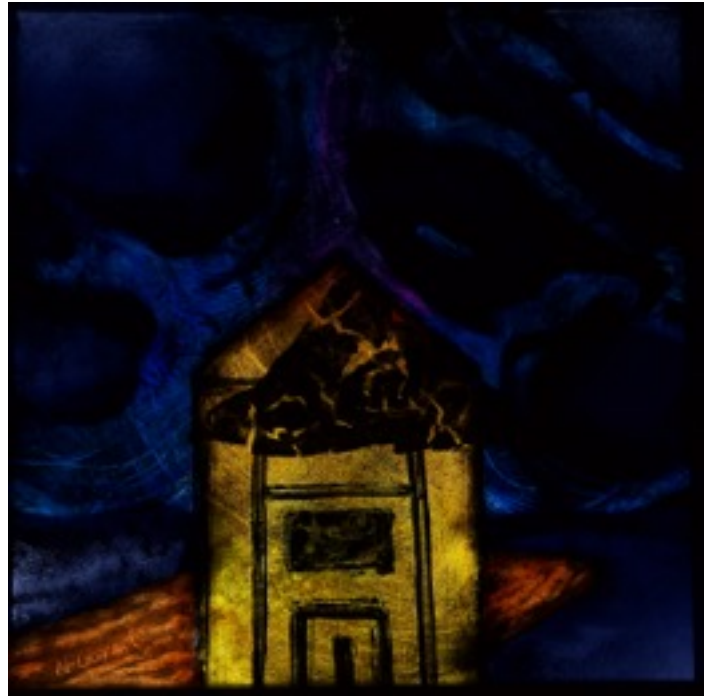
Ninth Plague- DARKNESS - CHOSHECH