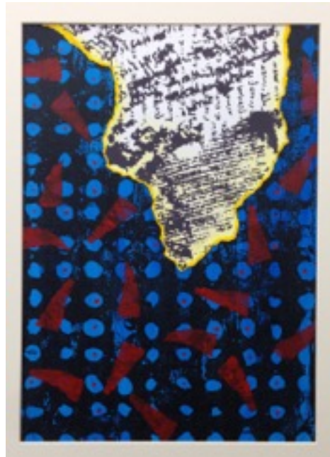
Tenth Plague- DEATH OF THE FIRSTBORN - MAKAT B'CHOROT

The Death of the Firstborn results in the release of the Israelites, and they are seen departing Egypt from the land of Goshen. They leave behind a grid of black death with scattered red shapes: the destruction of Egyptian gods and society.