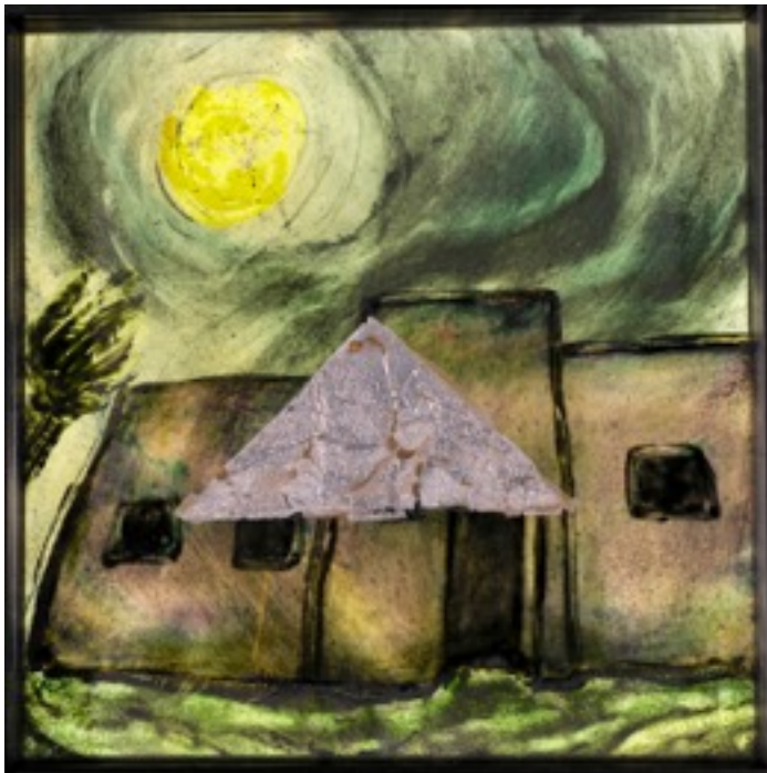
Third Plague- GNATS - KINIM

When God strikes Egypt with the plague of Gnats, the magicians admit defeat, but not Pharaoh, nor does he in the ensuing plagues of Swarming Things and Cattle Disease (Murrain). He is given the opportunity to repent and acknowledge God, but each time that he refuses he becomes more deeply attached to his ego and ensnared in his own pride. The pyramid of Pharaoh's heart is no longer gold, but it is strongly silver in the third plague, then progressively disintegrates in the fourth and fifth plagues.