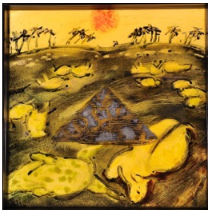
Fifth Plague- MURRAIN - DEVER