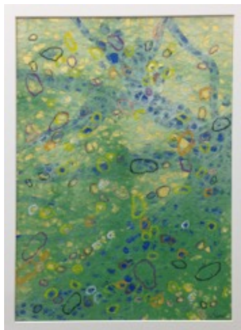
Second Plague- FROGS - TZ'FARDAYAH