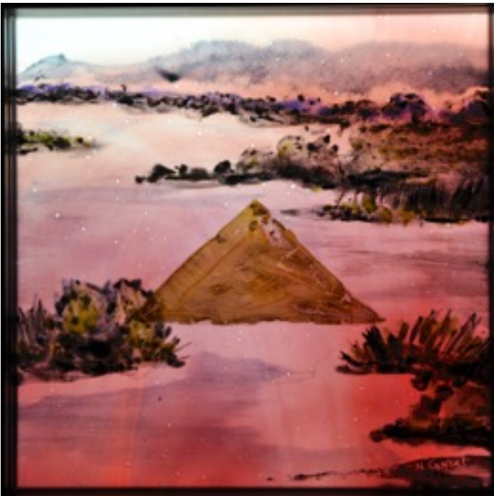
First Plague- BLOOD - DAM

The plagues of Blood and Frogs do not impress Pharaoh or the Egyptians, because their magicians call up more blood and frogs. The gold pyramids represent Pharaoh's supreme confidence in his own godhood and his refusal to "know God" or free the Israelites.