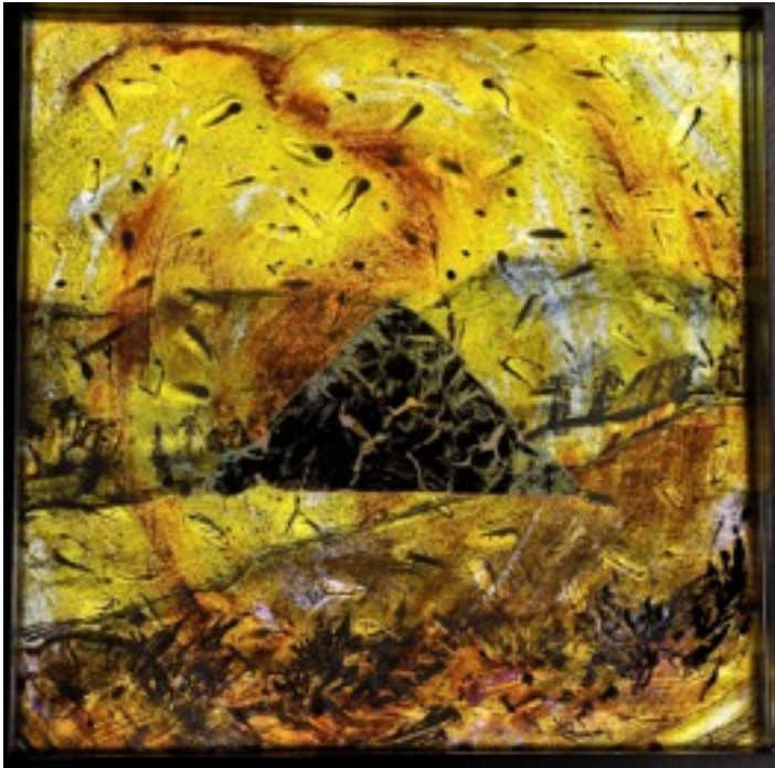
Eighth Plague- LOCUSTS - ARBEH

The plagues of Locusts, Darkness and the Death of the Firstborn result in the release of the Israelites. Pharaoh can no longer resist the cries of his people when he finds his own son dead, and he relents temporarily, long enough for them to leave. Although his prideful heart seems to have suffered defeat, he still does not want to completely acknowledge G-d and will chase the Israelites into the Sea of Reeds.