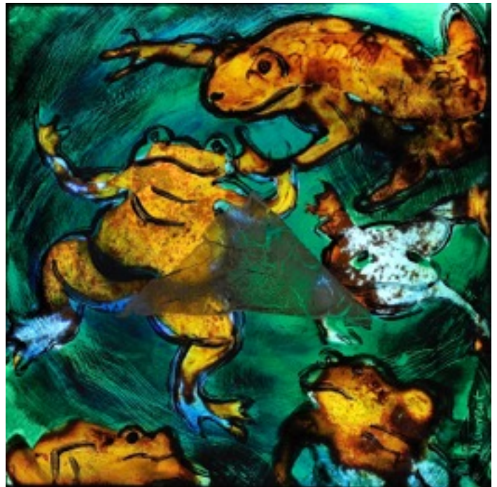
Second Plague- FROGS - TZ'FARDAYAH