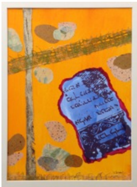
Fifth Plague- MURRAIN - DEVER