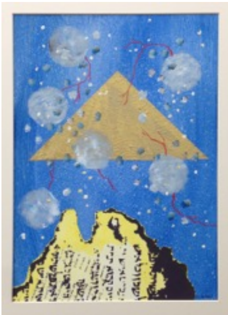
Seventh Plague- HAIL - BARAD

Hail, Locusts and Darkness reveal the fulfillment of God's prophecies about what would happen to Egypt should Pharaoh continue to refuse to acknowledge Him. God made Pharaoh's heart "strong" (the actual meaning of "hardening his heart") so that Pharaoh could exercise his free will, but he was caught in a trap of his own making. As a result, these plagues inflict increasing darkness on Egypt as a prelude to the final "darkness", the death of the firstborn. In Goshen, however, Israelites live in light and plenty, unscathed by the plagues. The color blue in the background symbolizes the theme of prophecy.