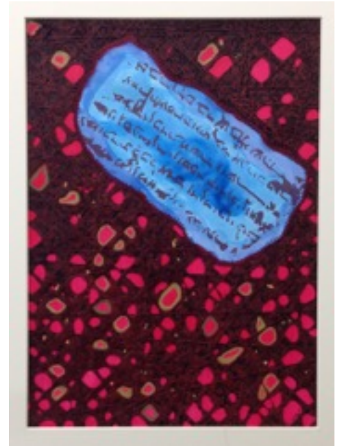
Sixth Plague- BOILS - SH'CHIN