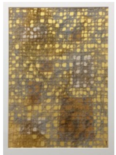
Third Plague- GNATS - KINIM