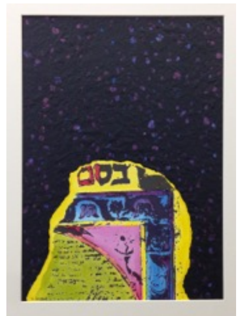
Ninth Plague- DARKNESS - CHOSHECH