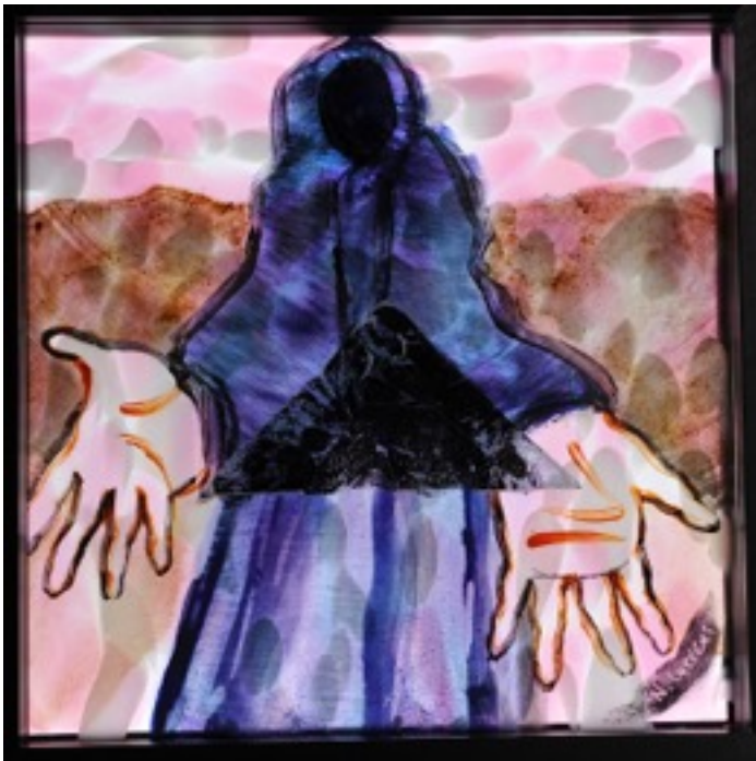
Sixth Plague- BOILS - SH'CHIN

Boils and Hail signal increasingly personal attacks on the people of Egypt. Some rabbis explain that God strengthens Pharaoh's heart (the word "chazayk" means "strengthen") so that he can resist the pleas of his people to let the Israelites go, and instead indulge the wishes of his prideful heart, which he has spent the first five plagues reinforcing. The black pyramids represent this strengthening of Pharaoh's heart.