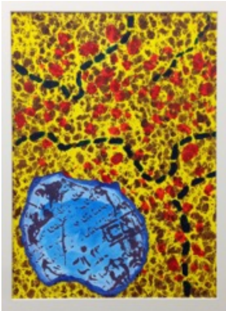
Fourth Plague- SWARMING THINGS - AROV

Thus the land of Goshen protects the Israelites so they and their animals do not suffer disease/defilement. Goshen is symbolized by fragments of Jewish manuscripts from the storeroom of the ancient Ben Ezra Synagogue in Cairo, known as the Cairo Genizah.