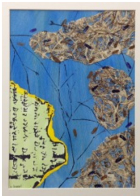
Eighth Plague- LOCUSTS - ARBEH